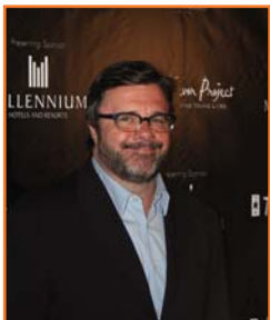
Honoree Nathan Lane

To kick off New York City's Pride festivities The Trevor Project held its seventh annual Trevor New York Benefit at the Hudson Theatre in the Millennium Hotel on Monday, June 25th. The event honored Nathan Lane with The Trevor Hero Award, and Bravo with The Trevor Commitment Award as well as Colin Higgins Youth Courage Award winners. The event brought out over 400 Trevor supporters and raised $150,000 for the organization. The evening also introduced the Randy Stone Call Center Campaign, which plans to open a New York Call Center this year and a third call center by 2010. Many thanks to our crew of volunteers who helped with the event and our NY Steering Committee!